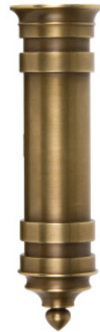
MEDIUM ANTIQUE BRASS