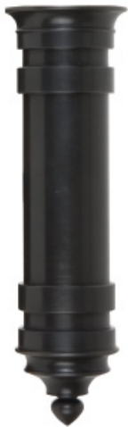
DARK WAXED BRONZE