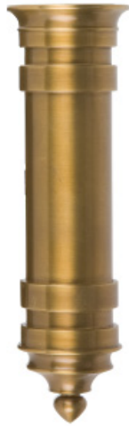
LIGHT ANTIQUE BRASS