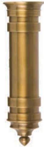
LIGHT ANTIQUE BRASS