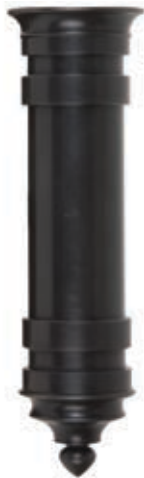
DARK WAXED BRONZE