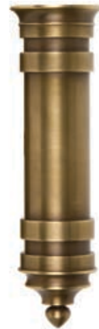
MEDIUM ANTIQUE BRASS