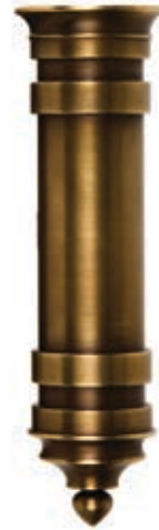
DARK ANTIQUE BRASS